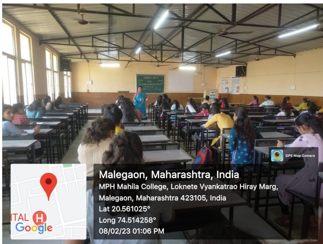
Participated Students during Quiz Competition